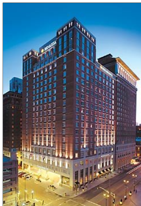
Renaissance Grand Marriott, St. Louis, MO