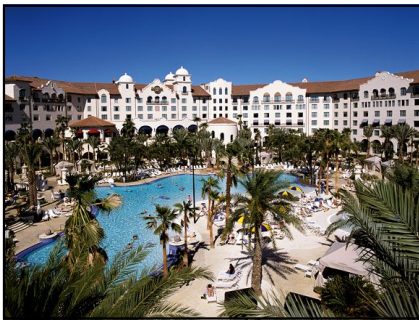
Hard Rock Hotel Orlando, FL