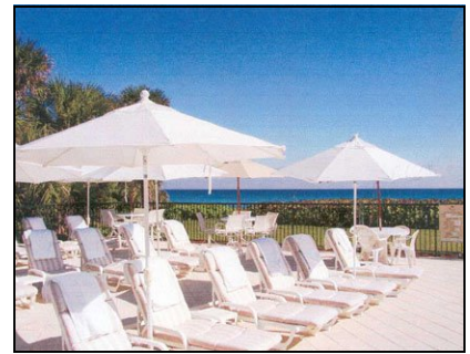
Frenchman's Creek Palm Beach Gardens, FL