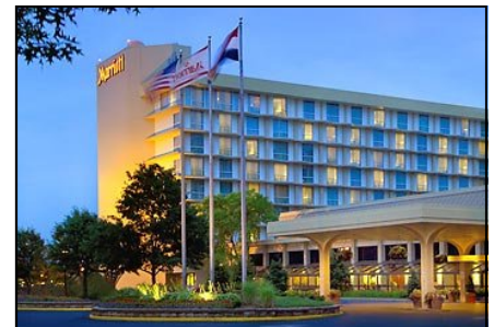
Marriott Airport St. Louis St. Louis, MO